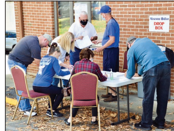
Towns County poll workers are directing voters to fill out a small form upon arrival for early in-person voting at the Elections Board Office.